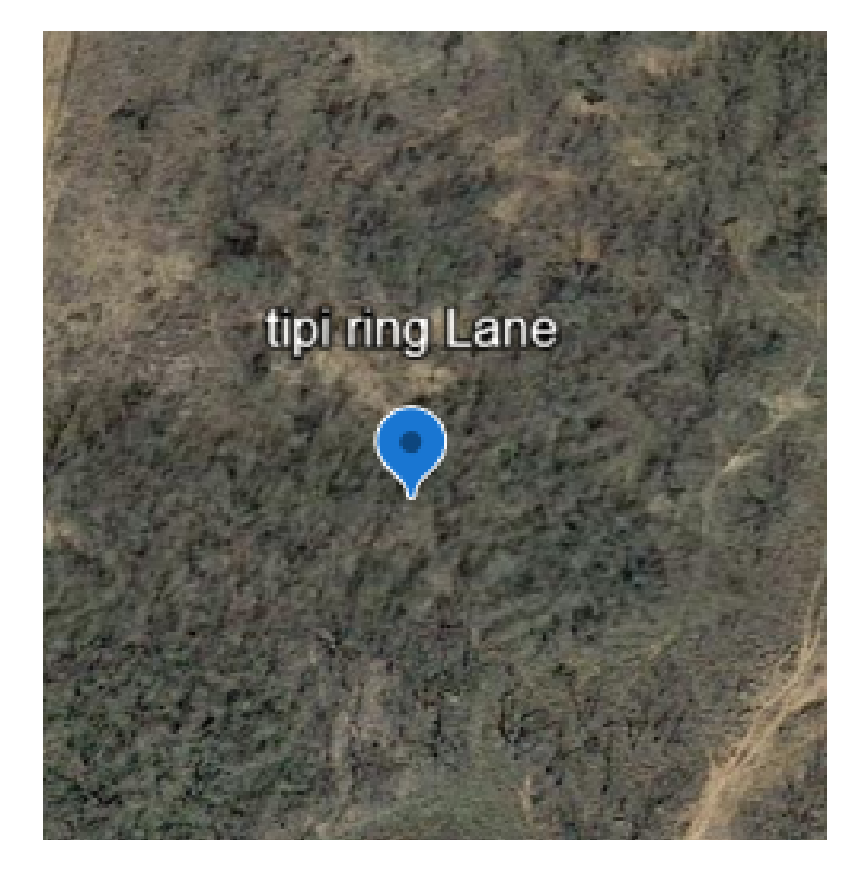
Click to learn more about Santa Anna, TX: <a href="http://www.santaannatxchamber.com/">http://www.santaannatxchamber.com/</a>